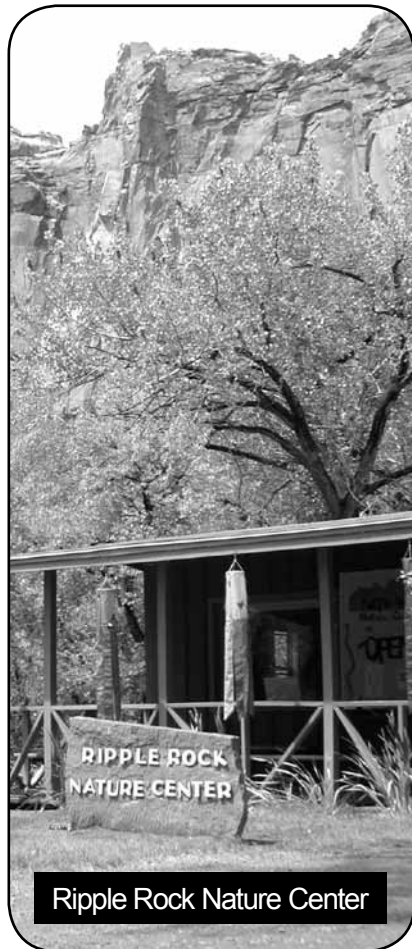
Ripple Rock Nature Center

Main Street*Torrey *Burgers* Shakes*Onion Rings* *Free Wi-Fi* *Playground*